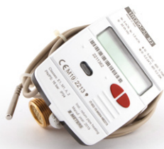
THERMAL ENERGY METERS