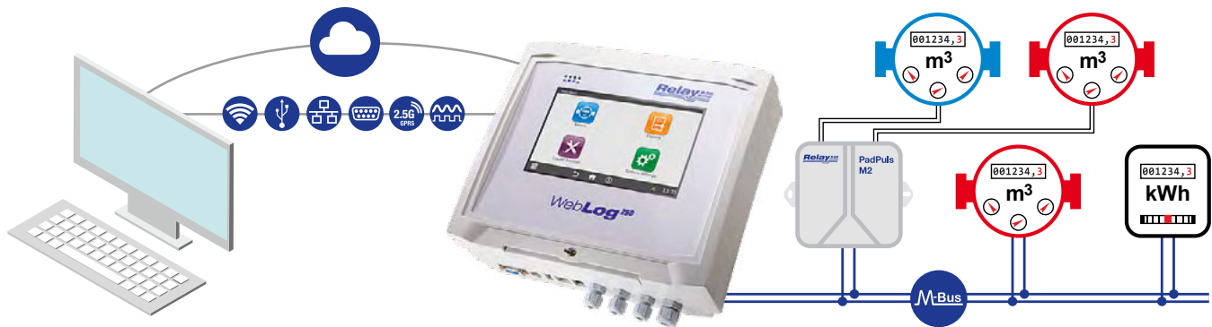
Remote access via web browser